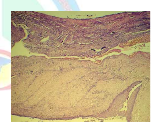
Figure 3: The section taken from the tissue attached to the neck of the tooth, exhibiting thin epithelial lining resembling reduced enamel epithelium of 2 to 3 layers thick(H & E X 4).

The connective tissue demonstrated few chronic inflammatory cells predominately lymphocytes and few plasma cells. The blood vessels lined by endothelial cells and cholesterol clefts were also observed.