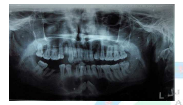
Figure 1: Orthopantomogram, showing a M well-defined radiolucency with corticated D borders, enclosing impacted mandibular S right and left canine.

Intra oral examination revealed missing permanent mandibular left and right canine. Therefore an orthopantomogram was taken to assess the condition of canines. Orthopantomogram revealed a well-defined radiolucency with corticated borders, extending from lower left second premolar to right second premolar region which was also enclosing impacted mandibular right and left canine (Figure 1).