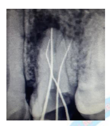
Figure 3: Working length radiograph.