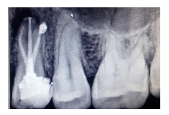
Figure 5: Obturation 24

Meticulously observing the radiograph and exploring clinically, led to the conclusion that the buccal root of the premolar bifurcated in the coronal half of the root. The coronal half of the buccal canal was flared and enlarged before taking the working length for convenience form. The working length radiograph confirmed the presence of three roots. Canals were then prepared by hand filing till 15 number file. Combined hand and rotary protaper was used in bifurcating buccal root to reduce strain on the rotary files. The canals were prepared upto F2 protaper files. Copious irrigation with 1% sodium Hypochlorite was used during biomechanical preparation.