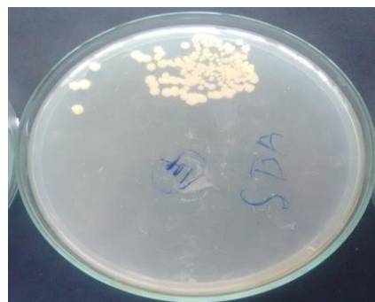
FIGURE 1: Growth of candidal colonies on sabouraud’s dextrose agar media