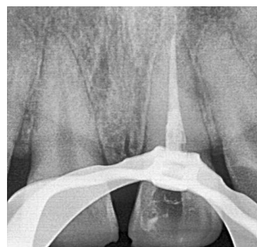
FIGURE 6 – Obturation after file retrieval

Canals were dried with paper points and obturated using Cold Lateral Compaction Technique using AH PLUS sealer. (Figure 6).