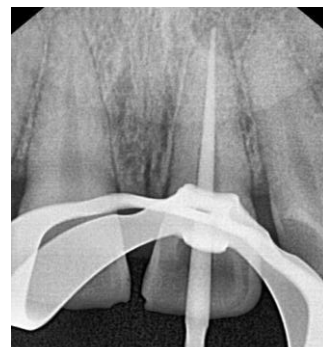
FIGURE 5 – Mastercone selection done

After the retrieval, through irrigation with 3% Sodium Hypochlorite was done. Master cone selection was done (Figure- 5).