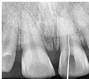
FIGURE 2 – Trying to bypass the fracture file.

Routine endodontic treatment with instrument retrieval was planned for the patient. After complete history taking, local anaesthesia was administered to the patient. The concerned tooth 21 was isolated using rubber dam. The temporary filling material was removed. Starting with an ISO # 8 K-file, and attempt was made to bypass the instrument at working length. Progressively, ISO # 8, no d finer (Mani Co. In), 8 no c plus file (DENTSPLY)files were used (FIGURE -2).