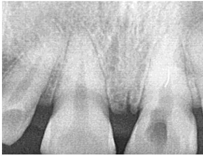
FIGURE 1- Pre operative radiograph of tooth with fractured file segment.

separated instrument and the prognosis of the tooth and consent was taken (FIGURE – 1).