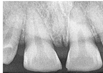
FIGURE 3 – Radiograph taken after file retrieval

Subsequent biomechanical preparation was done using progressive files along with EDTA and sodium hypochlorite for irrigation days. Calcium hydroxide dressing was placed for 7 days. No pain was observed after 7 days. After removing the temporary filling, the calcium hydroxide dressing was removed from the canal of the tooth and the canals were thoroughly irrigated. After biomechanical preparation up to 25/6, the separated fragment became little loose in the canal. Ultrasonic GOLDEN tips (ORIKAM) were used to loosen it further and then irrigated it thoroughly to retrieve the fragment. RVG was taken to confirm the complete retrieval (Figures 3).