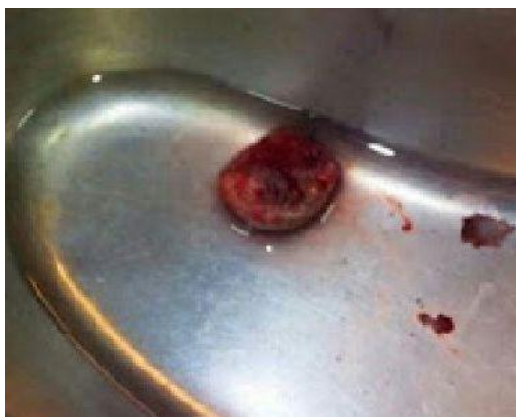
Figure 04 EXCISED TISSUE