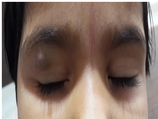
Figure 01:PRE OPERATIVE