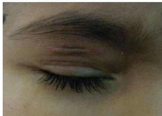
Figure 02: POST OPERATIVE