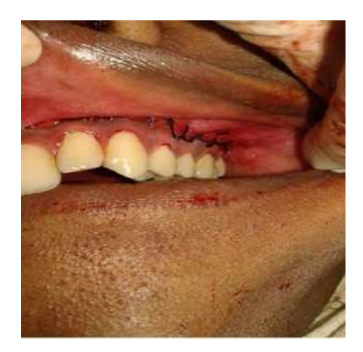
Figure 5: Showing primary closure after enucleation