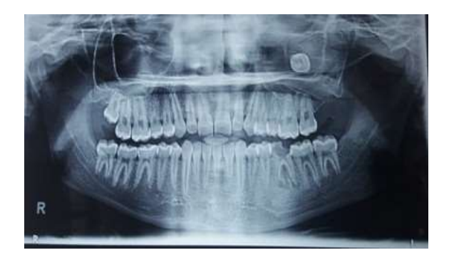
Figure 2: OPG showing ectopic location of maxillary left third molar