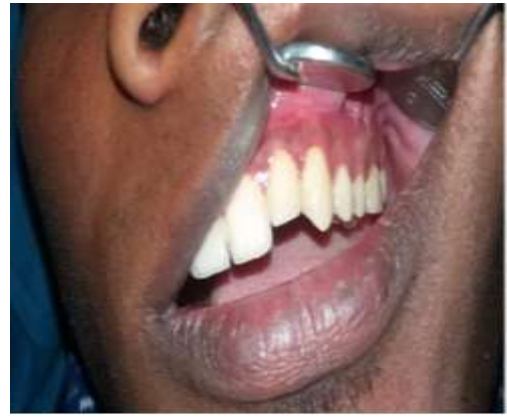
Figure 8: Follow- up showing complete healing of the surgical site