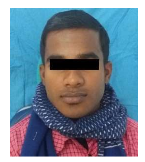
Figure 1: Profile of the patient