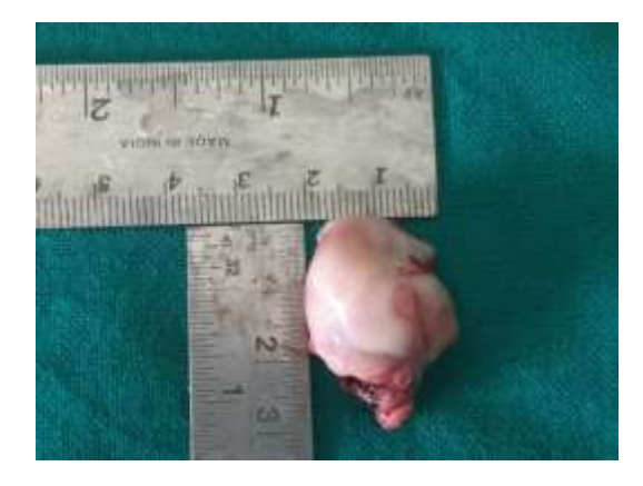
Figure 4 – Excised lesion, approximately 3 cm x 2 cm.