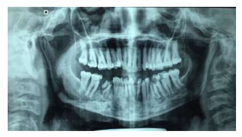
Figure 6 – Orthopantomogram showing bone loss in 31, 32, 41 and 42 region.