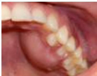
Figure 1: The intraoral examination revealed a palatine growth in the premolar-molar region.

The microscopic study the decalcified Hematoxylin and Eosin stained sections showed presence of sheets and trabeculae of cementum like material and few bony trabeculae surrounded by a cellular fibro vascular stroma, adjacent to the apical portion of the root. At places few osteoclastic multinucleated giant cells were seen (Figure 4).The diagnosis of Benign cementoblastoma was achieved. The patient was followed up for one year and no evidence of recurrence was noted.