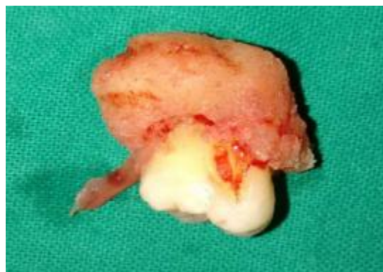
Figure 3: Tumor attached with the roots.