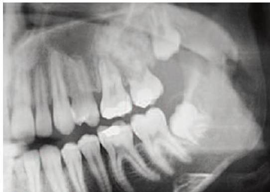
Figure 2: Radiographically, a large radiopaque lesion was present in the upper-left quadrant, with a surrounding rim of radiolucency. This was associated with the roots of 27, which showed evidence of resorption.