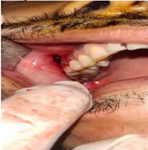
Fig no.5 Surgical Site