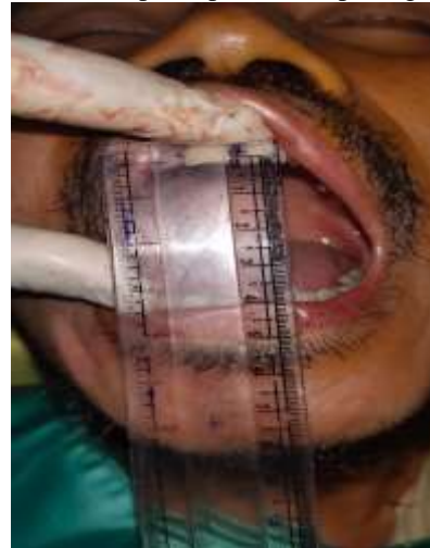
Fig no. 8 immediate post op mouth opening