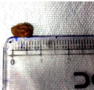
Figure 2: Gross biopsy findings