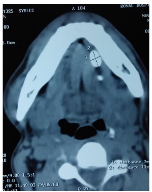
Figure 3: Axial CT scan showing 2 calcifications