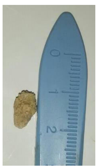
Figure 6: Sialolith measuring 1 cm in size.