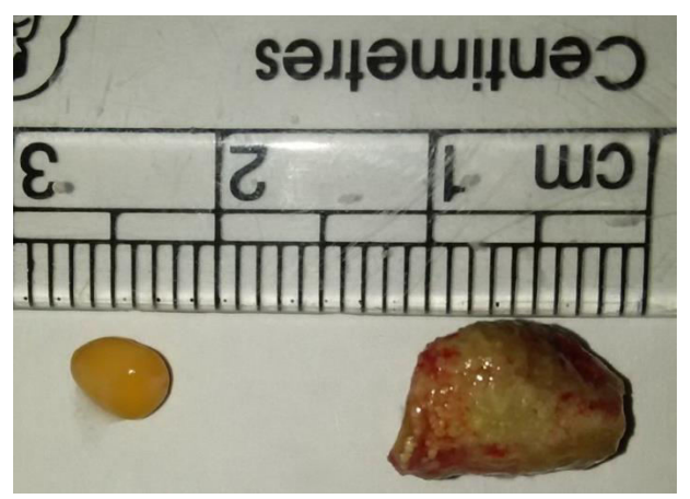
Figure 4: Sialoliths measuring 1.3 cms and 0.5 cms