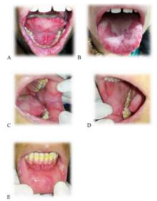
FIGURE 5- FOLLOW UP 2 , (A) increase in ulcerations over the lateral borders and ventral surface of tongue, (B) reduced coating on tongue giving it a geographic appearance, (C) persistent ulceration on left buccal mucosa, (D) reduced ulceration on the right buccal mucosa, (E) reduced ulceration on the lower labial mucosa.