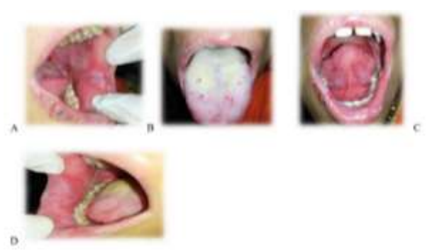
FIGURE 4 - FOLLOW UP 1-(A) slightly reduced ulcerations on left buccal mucosa, (B) increased coating on dorsal surface of tongue, (C) ulcers seen over ventral surface of tongue along with haemorrhagic crusts on the labial mucosa of lower lip and on the vermillion border of lower lip (D) reduced ulcertion on the right buccal mucosa.