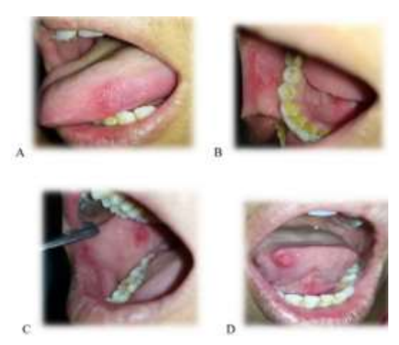
FIGURE 8- FOLLOW 4, recurrence of ulcers on, (A) left lateral border of tongue, (B) right buccal musoca, (C) right retromolar area, (D) right side on ventral surface of tongue.