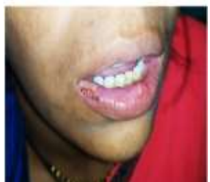
FIGURE 2 – Blood filled crustations along with ulcerations seen over the lower lip.