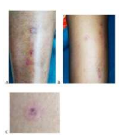
FIGURE 1- Erythematous papules with well defined border suggestive of typical "target lesions", seen over-(A) right leg; (B) left arm (C) enlarged view of target lesions.