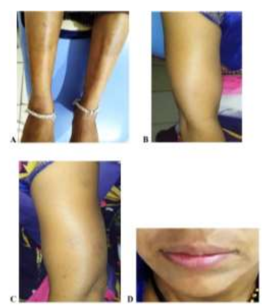
FIGURE 7- (A-C) completely healed target lesions seen over the extremities and (D) completely healed haemorrhagic crustations over the upper and lower lip.