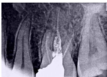
Figure 1: Preoperative Periapical radiograph of Left Maxillary First Molar

Chronic apical periodontitis was made and endodontic retreatment was planned. Radiographic evaluation of the involved tooth failed to indicate any variations in the canal anatomy. Improperly obturated palatal root canal was observed (Figure 1).