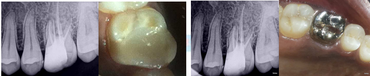
Figure 5: Radiographs after Composite Restoration