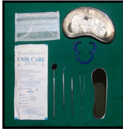
ARMAMENTARIUM FOR RECORDING PERIODONTAL PARAMETERS