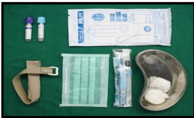
Fig 03: ARMAMENTARIUM FOR BLOOD SAMPLE COLLECTION FOR CRP & VARIOUS HEMATOLOGICAL PARAMETERS