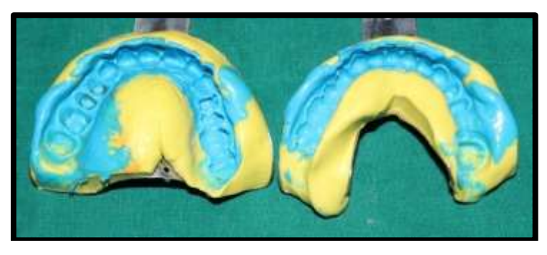
Fig 12: Final impression