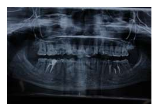
Fig 2: Pre-Operative OPG