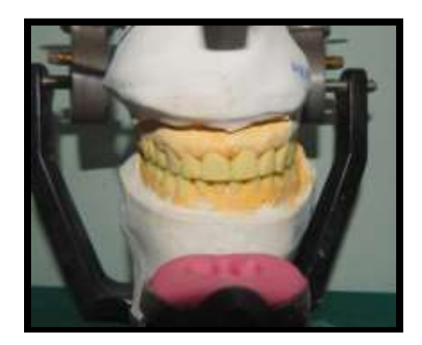
Fig 6: Diagnostic Wax-Up