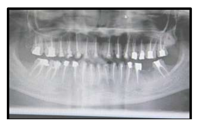
Fig 3: Post RCT OPG