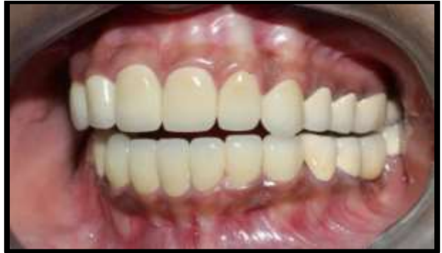
Fig 13 A&B: Canine Guided Occlusion On Right And Left Side