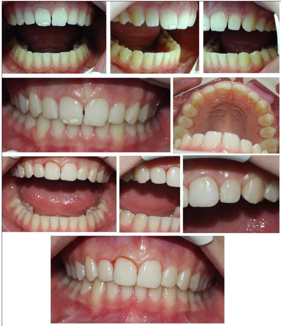
Figure 1: Pre-treatment and post-treatment images of the patient's teeth