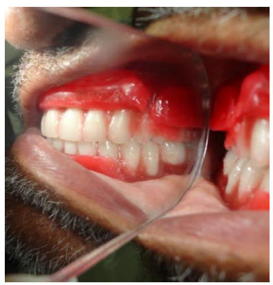
Figure 5: Try-in with lip and cheek plumpers