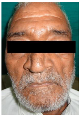
Figure 1: Preoperative extra oral frontal view

Final prosthesis was given to the patient. Patient was cautioned about avoiding the use of any acidic material for cleaning and avoiding acidic food beverages as they may corrode the push buttons. Patient was given oral hygiene maintenance instructions. Patient was explained that he could any or all plumpers if he is uncomfortable as during mastication of food.