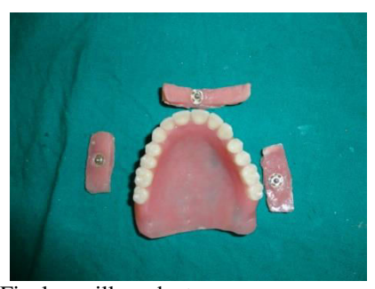
Figure 6: Final maxillary denture