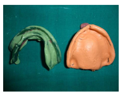
Figure 4: Final impression