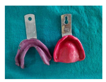
Figure 3: Primary impression