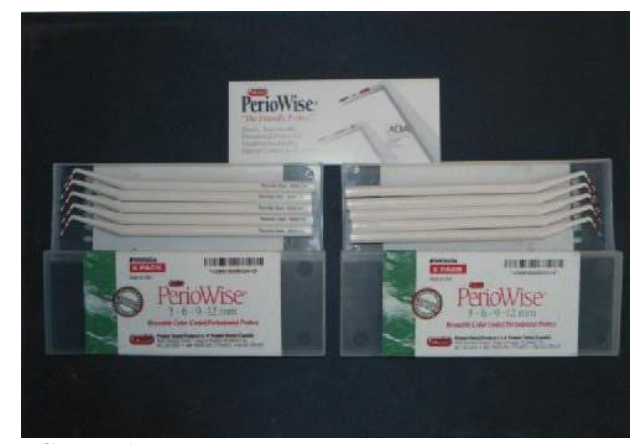
FIGURE-1 PERIOWISE COLOR-CODEDPOLYMERIC PROBE-1ST GENERATION

Examiners 1 and 2 showed the variation of within \leq 0.5mm in 70% and 60% of study sites and more than >0.5mm variation in 30% and 40% of study sites respectively, on probing depth measurement by using two probing techniques at \geq 5mm probing sites.