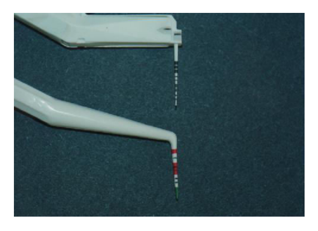
FIGURE-2 TRUE PRESSURE SENSITIVE PROBE AND PERIOWISE COLOR CODED POLYMERIC PROBE