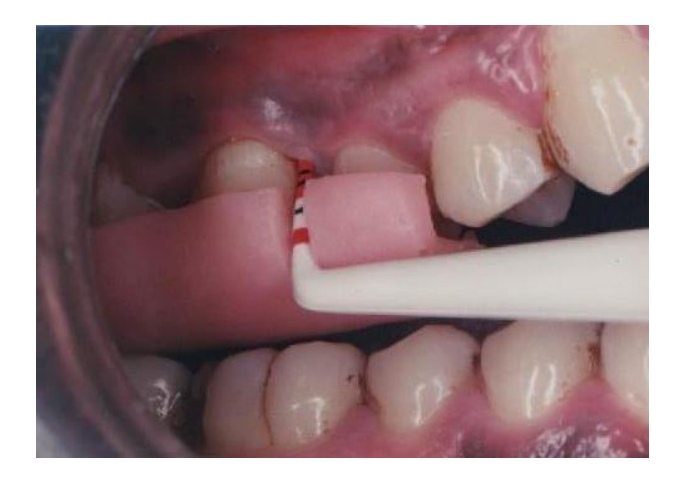
FIGURE-4 PERIOWISE CCPP DEPICTING (≥5MM) POCKET OR PROBING SITE