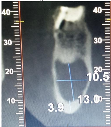
Figure 3: CBCT showing the size of the lesion