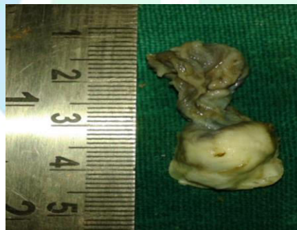
Figure 2: Specimen measuring approximately 3 x 1.5 cm in diameter delivered in total.

consisting dense bundles of collagen fibers, endothelial lined blood vessels, areas of mild inflammatory cell infiltrates and adipose tissue. The lumen was filled with desquamated orthokeratin. No dermal appendages were found. Based on the clinical and histopathological features the final diagnosis of epidermoid cyst was given. (Fig.3)