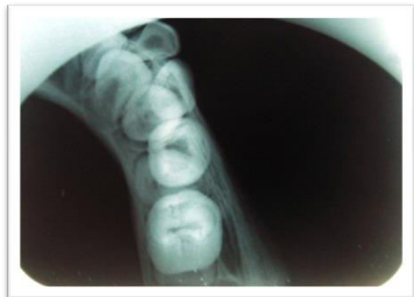
Figure 1: shows preoperative radiographs of the patient