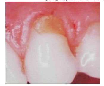
Pre operative 13