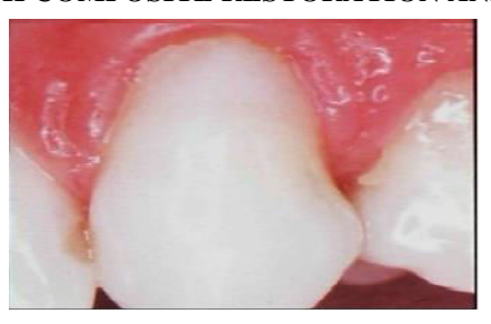
After 24 hrs of restoration, surgical coverage with coronally advanced flap.