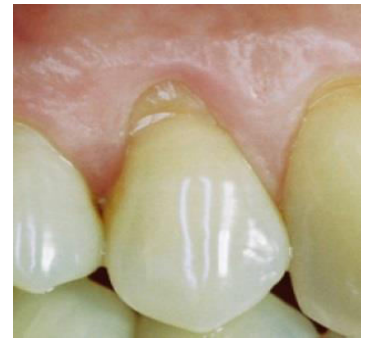
Pre operative view 24