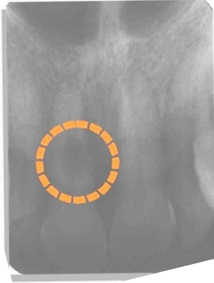
Figure 2: Radiographic examination revealed radio transparent lacuna on the middle third of the root.

After a week sutures was removed, the tooth was asymptomatic and the patient was comfortable.