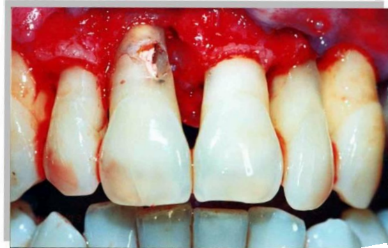
Figure 4: A full thickness mucoperiosteal flap was raised, lacunar root resorption and defect was exposed.

as an intracanal medicament for a week. Obturation was done after a week and the surgical procedure was performed (Figure 3). A full thickness mucoperiosteal flap was raised, lacunar root resorption and defect was exposed (Figure 4). A deep intra-bony mesial two wall defect with lack of vestibular cortical plate was seen. Thorough curettage of granulation tissue was done and trichloroacetic acid was used topically on the resorptive defect to control hemorrhage.