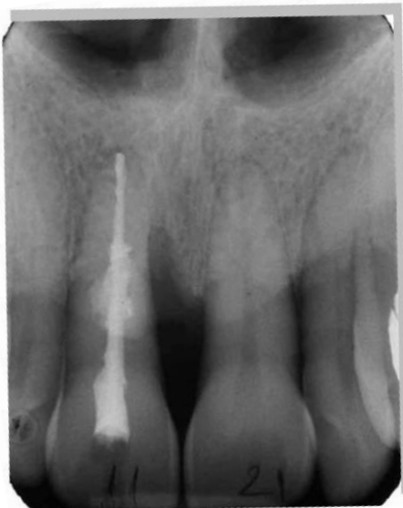
Figure 3: Endodontic treatment was performed

as an intracanal medicament for a week. Obturation was done after a week and the surgical procedure was performed (Figure 3). A full thickness mucoperiosteal flap was raised, lacunar root resorption and defect was exposed (Figure 4). A deep intra-bony mesial two wall defect with lack of vestibular cortical plate was seen. Thorough curettage of granulation tissue was done and trichloroacetic acid was used topically on the resorptive defect to control hemorrhage.