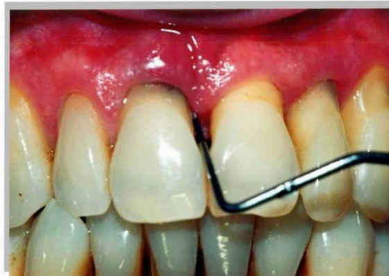
Figure 1: Pre operative picture showing discoloured of cervical aspect of the central incisor.

Access opening was done using Endo access bur (Dentsply Tulsa, UK) to allow access into the pulp chamber and preparation of the chamber walls, in one operation.