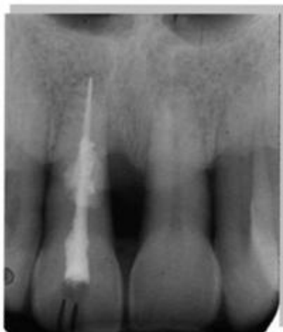
Figure 7: Radiographic examination showed that the defect was filled by about 80 %

The patient returned back after 18 months for a follow up (Figure 6). Periodontal examination revealed a reduction in pocket depth from 9 mm to 3 mm and a clinical attachment loss from 13mm to 10 mm. No exudate or discoloration was found. Radiographic examination showed that the defect was filled by about 80 % (Figure 7).