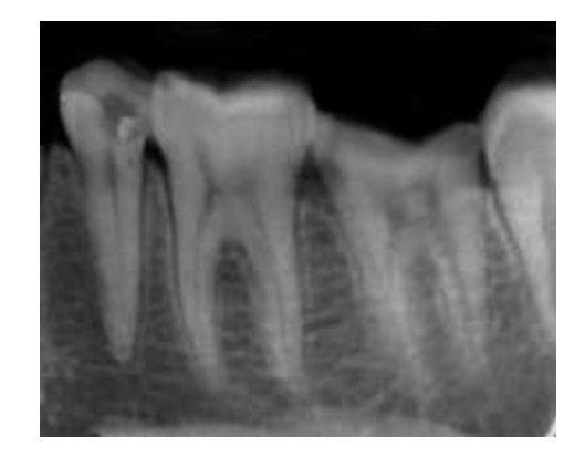
Figure 2. Preoperative radiograph