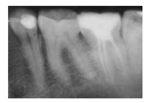
Figure 4. Postoperative radiograph