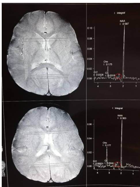
MR Spectroscopy shows Absence of Cr peak