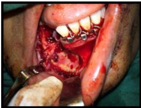
Figure 2: Intra-operative photograph showing bony cavity after enucleation and peripheral osteotomy

After a right mandibular parasymphiseal vestibular incision, the tumor was exposed and found to be encased in bone. The involved teeth i.e. 44, 45 and 46 were extracted. The tumor was excised and peripheral osteotomy of surrounding bone done. Every effort was made to maintain the integrity of the inferior alveolar nerve [Figure 2]. Post operatively, the wound was packed with ribbon gauze and sutured. The pack was removed after 48 hours and the suturing completed. The wound was allowed to heal without intervention afterwards.