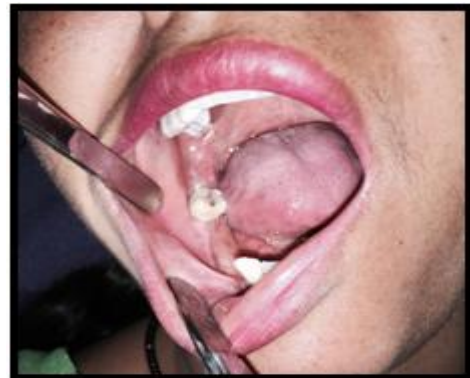
Figure 5: Post-operative Photograph after 8 months of enucleation

The patient was kept on regular follow-up and no significant signs of recurrence were seen even after 8 months. The paresthesia of the right lower lip and chin persisted but did not worsen with time. There was uneventful soft tissue and bone healing. [Figure 5 and 6]