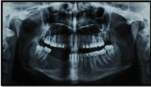
Figure 6: Post-operative OPG after 8 months of enucleation