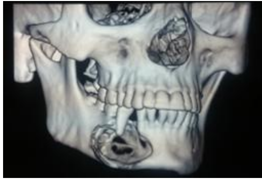
Figure 1: 3D reconstruction of CT scan showing extent of lesion and perforation of buccal cortex

Mandibular occlusal view revealed marked expansion of buccal cortical plate with continuity and thinning of border and slight expansion of lingual cortical plate with presence of thin septa.