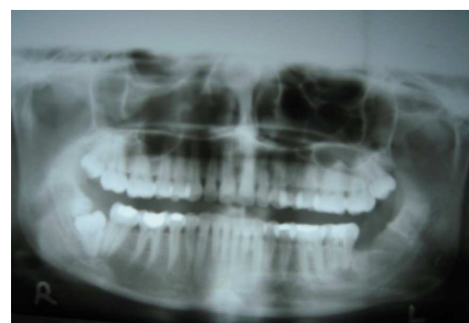
Figure 9: Post Operative O.P.G. After Autologous Tooth Transplantation