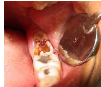
Figure 6: Surgical Curettage of Periapical Lesion