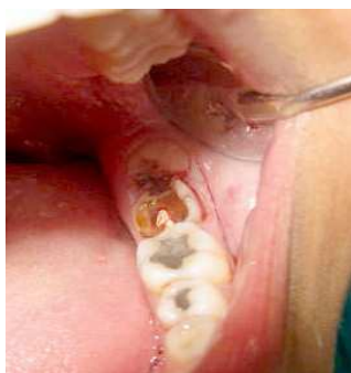
Figure 1: Grossly Carious Mandibular Second Molar and Impacted Third Molar

and infiltration under aseptic technique, the left lower third molar and grossly carious lower second molar were extracted carefully to avoid root fracture (Figure 1-9). The lower left third molar was kept in normal saline (storage medium). RCT was completed with retro filling and sealing of root apex by MTA which has property of promoting healing and cementogenesis. The alveoli socket was widened using surgical bur and the stored lower left third molar was held in place by a composite splinting. Patient was asked to do warm saline gargles and was put under antibiotic coverage. On recall visit, the implanted tooth was examined for mobility, which was absent. The composite splint was removed after 2 weeks and post-operative orthopantomogram was taken to assess the condition of implanted tooth. Similarly a total of 5 cases were done under aseptic conditions and all of them were reviewed at regular intervals (Table-1).