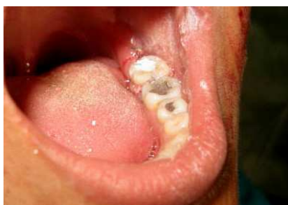
Figure 8: Post Operative View after Transplantation Of Mandibular Third Molar in Second Molar Socket