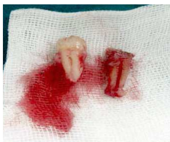
Figure 7: Extracted Donor and Recipient Site Teeth