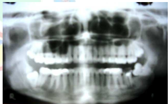
Figure 3: O.P.G. Showing Impacted Mandibular Third Molar