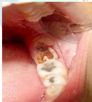
Figure 2: Surgical Incision