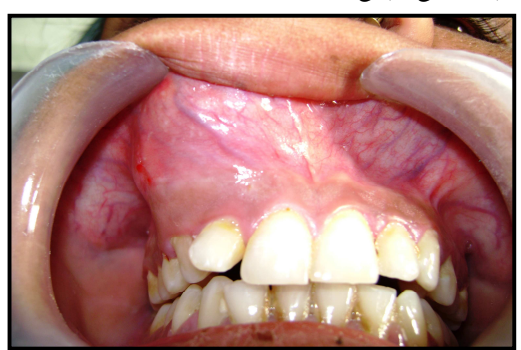
Figure 1: Intraoral examination showing the lesion.

Panoramic radiograph revealed a large, well-circumscribed radiolucency extending throughout the anterior maxilla from the right lateral incisor to the right first molar region involving maxillary sinus with impacted canine (Figure 2). The lesion produced an expansion of tissue and