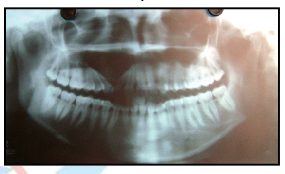
Figure 2: Panoramic radiograph revealed a large, well-circumscribed radiolucency.

extended into the alveolar processes, disrupting the usual orientation of the anterior teeth and first premolar tooth.