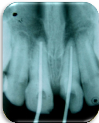
Figure 4: Master cone radiograph showing positive Biodentine apical plugs.

During the master cone selection Weine's 3 type apical end formation was evident, confirming the flowable characteristics of this novel dentin substitute. After master cone selection (Figure 4), obturation was done by cold lateral condensation technique (Figure 5). Access cavity was sealed with composite. The contact with the patient was lost but the patient did return after 3 months (Figure 5) and 6 months with a chipped of build up (Figure 6), on clinical examination the tooth was asymptomatic. IOPAR revealed positive changes, Weine's 3 type of root end formation, radiolucent area was absent and the trabecular bone was forming.