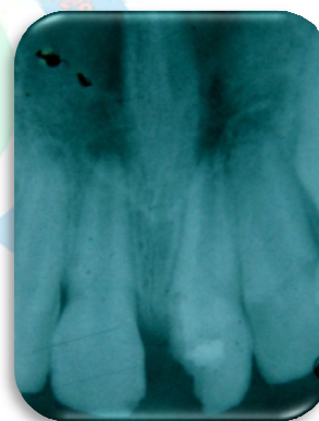
Figure 2: Radiograph showing removal of GP point in 21

During the instrumentation, the canal was irrigated copiously with 1% NaOCl solution and saline. After a final flush with NaOCl, the canal was rinsed with 5 ml 17% EDTA to remove the smear layer & final rinse with 2% chlorhexidine followed by a mixture of dexamethasone and saline to prevent phoenix reactions. Biodentine (septodont) was triturated for 30 seconds according to the manufacturer's instructions. The canals were dried and the mix was placed with MTA