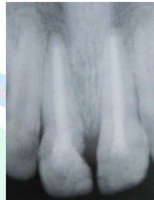
Figure 6: 6month follow up

Discussion: The response to trauma can be varied. Some pulps remain apparently normal with no adverse effects, whereas others become necrotic. When treating non vital teeth, main issue is eliminating bacteria from the root canal system. As instruments cannot be used properly in teeth with open apices, cleaning and disinfection of the root canal system rely on the chemical action of NaOCl as an irrigant. 8 In the past, several different materials such as amalgam, reinforced zinc oxide eugenol cements (interim restorative material [IRM], super ethoxy benzoic acid (EBA), glass-ionomer cement, and composite resin were used. 9 Recently, MTA, a refined "Portland cement, 10 was found to have less cytotoxic effects and better results with biocompatibility and microleakage protection, giving it more clinical success