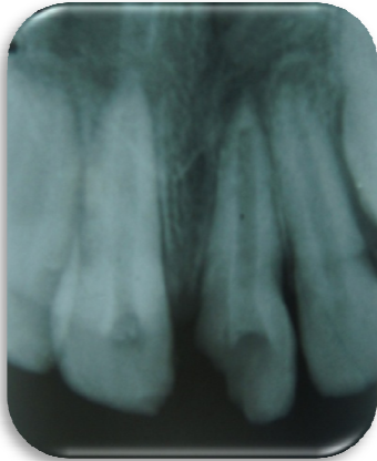
Figure 3: Radiograph showing placement of Biodentine apical plugs,

carrier in the apical portion of the canal. Increments were condensed using butt end of paper points (size-80) which provide a better proprioceptive control (Figure 3).