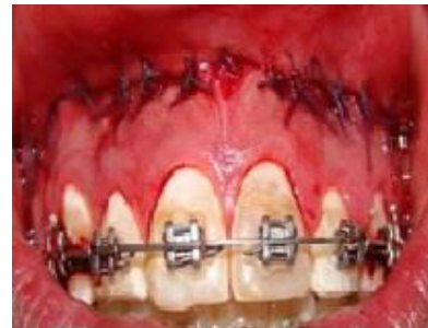
Figure 6: Interrupted sutures in place