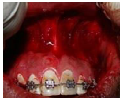
Figure 5: Partial thickness exposing underlying connective tissue