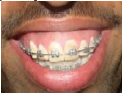
Figure 1: Pre operative smile

Non steroidal anti-inflammatory drugs (ibuprofen 600mg 3 times daily for 3 days after surgery. Post operative instruction - ice pack application, to minimize lip movements when smiling and talking for 1 week. Post operative healing occurred with minimal of ecchymosis and discomfort. The patient reported pain when smiling after surgery for 1 week. Sutures were removed 2 weeks later. The sutures line healed in the form of scar that was not apparent when the patients smiled, because it was concealed in the upper lip mucosa. 2 weeks later showed reduction in patient's excessive gingival display (figure 7). Post operative smile line was measured and it was measuring 24mm (figure 8).