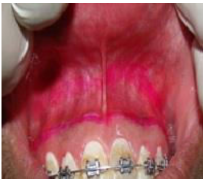
Figure 2: Incision marked using marking pencil