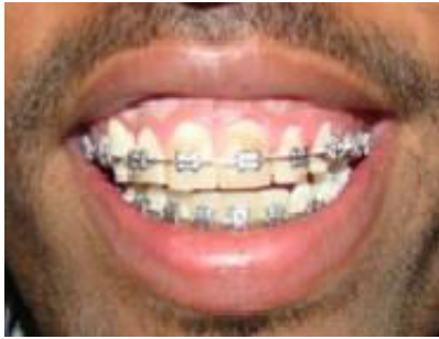
Figure 8: Post operative picture