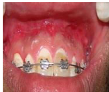
Figure 7: Healing after 2 weeks