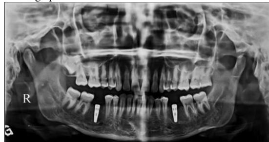
Figure 2: Image plus software to measure bone loss.