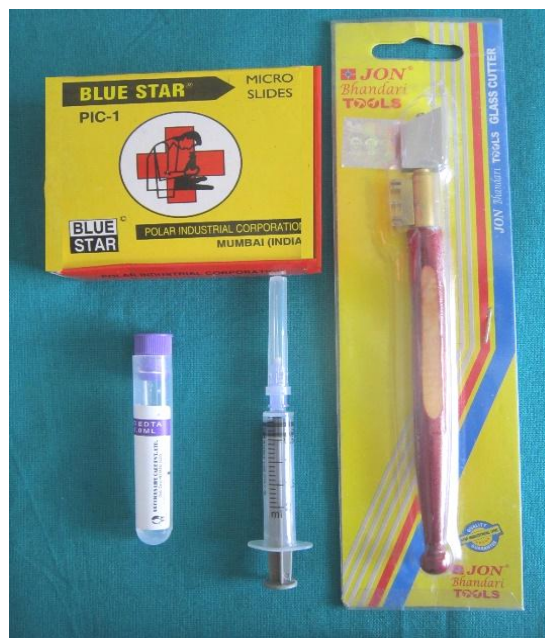
Fig 1: Photograph of glass slides, diamond glass cutter, EDTA vial and syringe used in study.

Blood samples from subjects were collected in vials containing anticoagulant EDTA. Immediately thin blood film was drawn by taking small drop of blood on glass slides and air dried. The glass slides was broken into 8mm×8mm pieces by diamond glass cutter. A piece from the tail portion having uniform and thin spread was selected and observed under the atomic force microscope with standard top view. Both AFM and LFM (Lateral force microscopy) images were captured simultaneously in real time. LFM images were obtained by taking into account the horizontal component of the force revealing surface roughness. The acquired images were processed using appropriate software.