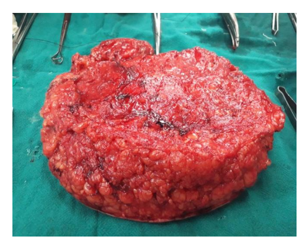
Fig 2). Resected breast specimen

The histopathology from right side thyroid(fig 3) revealed the papillary carcinoma with surrounding thyroid showing chronic lymphocytic changes. Thus, it was concluded that patient had synchronous double primary malignancy.