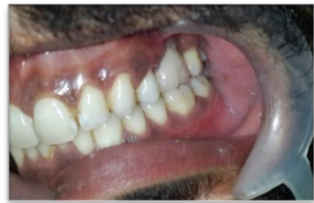
Figure 9: Postoperative photograph showing final prosthesis

11. The implant supported metal ceramic fixed prosthesis was fabricated (Figure 9).