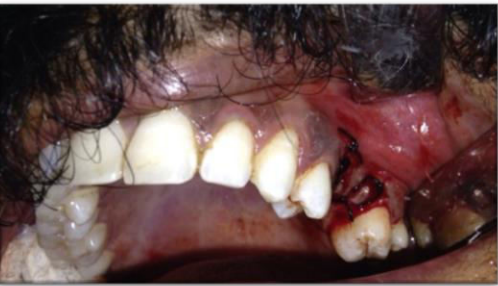
Figure 6 A and B: Photograph showing cover screw and suturing

9. After 7 days, sutures were removed. There were no sinus related complications and no other complications related to the procedure.