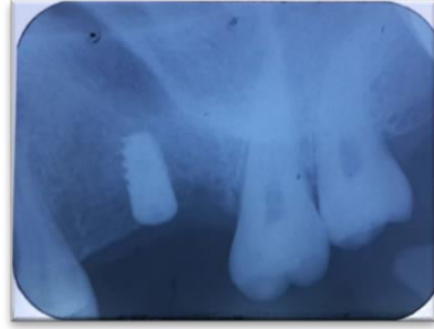
Figure 7: Intraoral periapical photograph after 6 months showing satisfactory osseointegration

After 6 months, prior to implant exposure, radiograph was taken so as to check for the osseointegration (Figure. 7). After satisfactory results, the implant was exposed and covered with the gingival former, so as to get the proper contour of the gingiva. (Figure. 8)