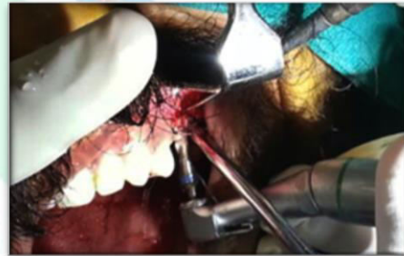
Figure 4: Drilling in the implant site

After the site was marked, a pilot drill with built in stopper dia. 2.40mm was used at a drill speed of 800-900 rpm with copious sterile saline irrigation. Then successive twist drills of 2.8mm, 3.2mm were used to prepare the osteotomy 2 mm short of the sinus floor. Final drill (conical drill dia. 3.30- 4.10) mm was not used so that implant compressed the bone so as to achieve primary stability.