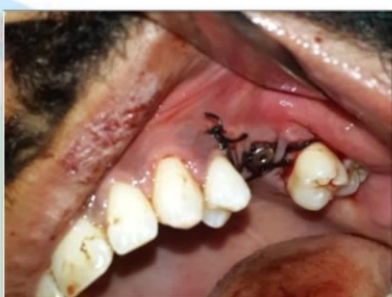
Figure 8: Gingival former placement

10. After a week, abutment was chosen and with the help of transfer coping, impression was made so as to get the master cast. The wax pattern was fabricated and casted and a metal framework was obtained.