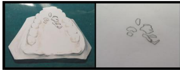
Figure 2: Maxillary impression making with perforated metal tray