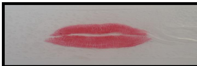
Figure 4: Showing lip prints taken of the subjects with lipstick