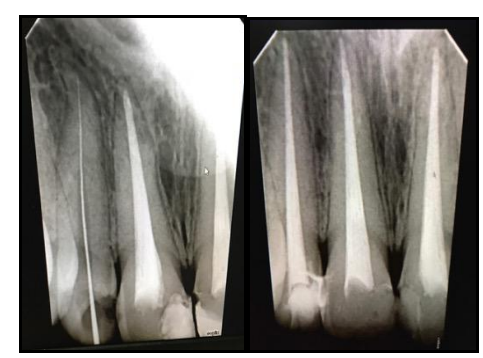
Figure 2: Radiograph with 12