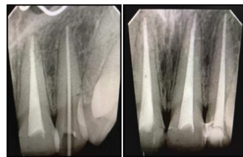
Figure 3: Radiograph with 22