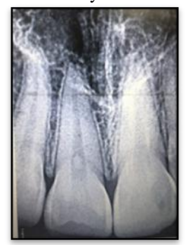
Figure 1: Pre-operative radiograph showing peri apical radiolucency seen with 11

Pain on percussion was observed with respect to 11 & 21. Provisional diagnosis of chronic irreversible pulpitis with 11 & 21 was made. Pulp sensitivity test using hot and cold which revealed that 12,13,22&23 showed response where as 11 & 21 showed delayed response. Radiographic examination showed class III caries with 11 and 21 with Periapical radiolucency with 11. (Figure 1) Final diagnosis of pulpal necrosis caused by dental caries was made.