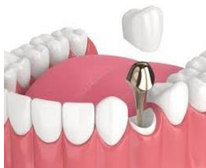
FIGURE.2 CAST POST-AND-CORE (CPC)

The specimens were individually embedded (mounted) in special specimen holder by means of epoxy resin (Exakto-form, Bredent) with elasticity modulus of 12 GPa. which is similar to elastic modulus of human bone (18 GPa) with the use of a test mount former, 2cm in dimension, 2-3 mm below the cemento-enamel junction (CEJ). A prefabricated printed jig made from Formlabs printer (Somerville, Massachusetts, United states) was used to position each tooth test mount former during immersion of the teeth in acrylic resin to standardize teeth position to be centralized within the test mounts.