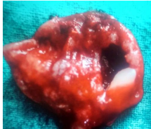
Fig-3: Photograph of gross specimen showing a cystic lesion around neck of impacted canine