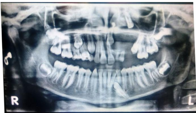
Fig-2: Photograph of OPG showing a radiolucency around an impacted canine