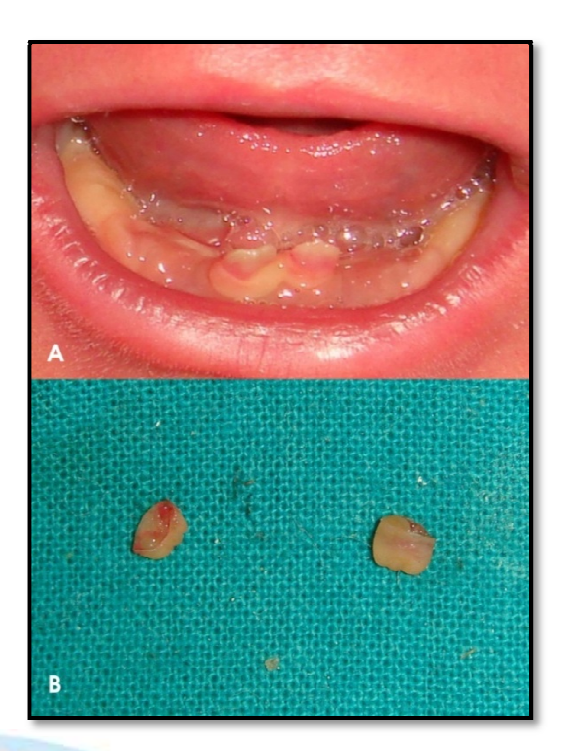
Figure 1: (A) Preoperative clinical appearance of natal teeth; (B) Extracted natal teeth.

A diagnosis of natal teeth was made. Extraction was chosen as treatment of choice and after obtaining the consent from the parents, prophylactic administration intramuscular injection of vitamin K was done one hour prior to procedure. The extraction of teeth followed by soft tissue curettage was done under topical anesthesia, which the patient tolerated well. The extracted teeth had crowns but were devoid of roots (Figure 1B). The patient was reevaluated after 2 days, and the recovery was found to be uneventful. Parents were advised regular follow up but they failed to maintain it.